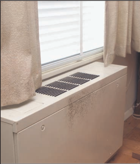
Mold growing on the surface of a unit ventilator.