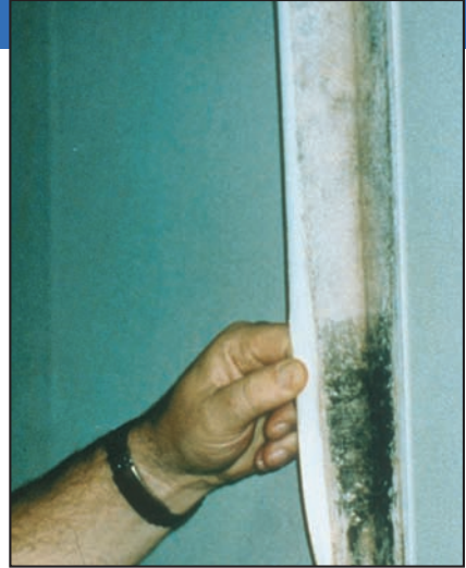
Mold growing on the back side of wallpaper.

Suspicion of hidden mold You may suspect hidden mold if a building smells moldy, but you cannot see the source, or if you know there has been water damage and residents are reporting health problems. Mold may be hidden in places such as the back side of dry wall, wallpaper, or paneling, the top side of ceiling tiles, the underside of carpets and pads, etc. Other possible locations of hidden mold include areas inside walls around pipes (with leaking or condensing pipes), the surface of walls behind furniture (where condensation forms), inside ductwork, and in roof materials above ceiling tiles (due to roof leaks or insufficient insulation).