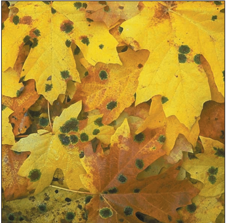
Mold growing on fallen leaves.

This document is available on the Environmental Protection Agency, Indoor Environments Division website at: www.epa.gov/mold